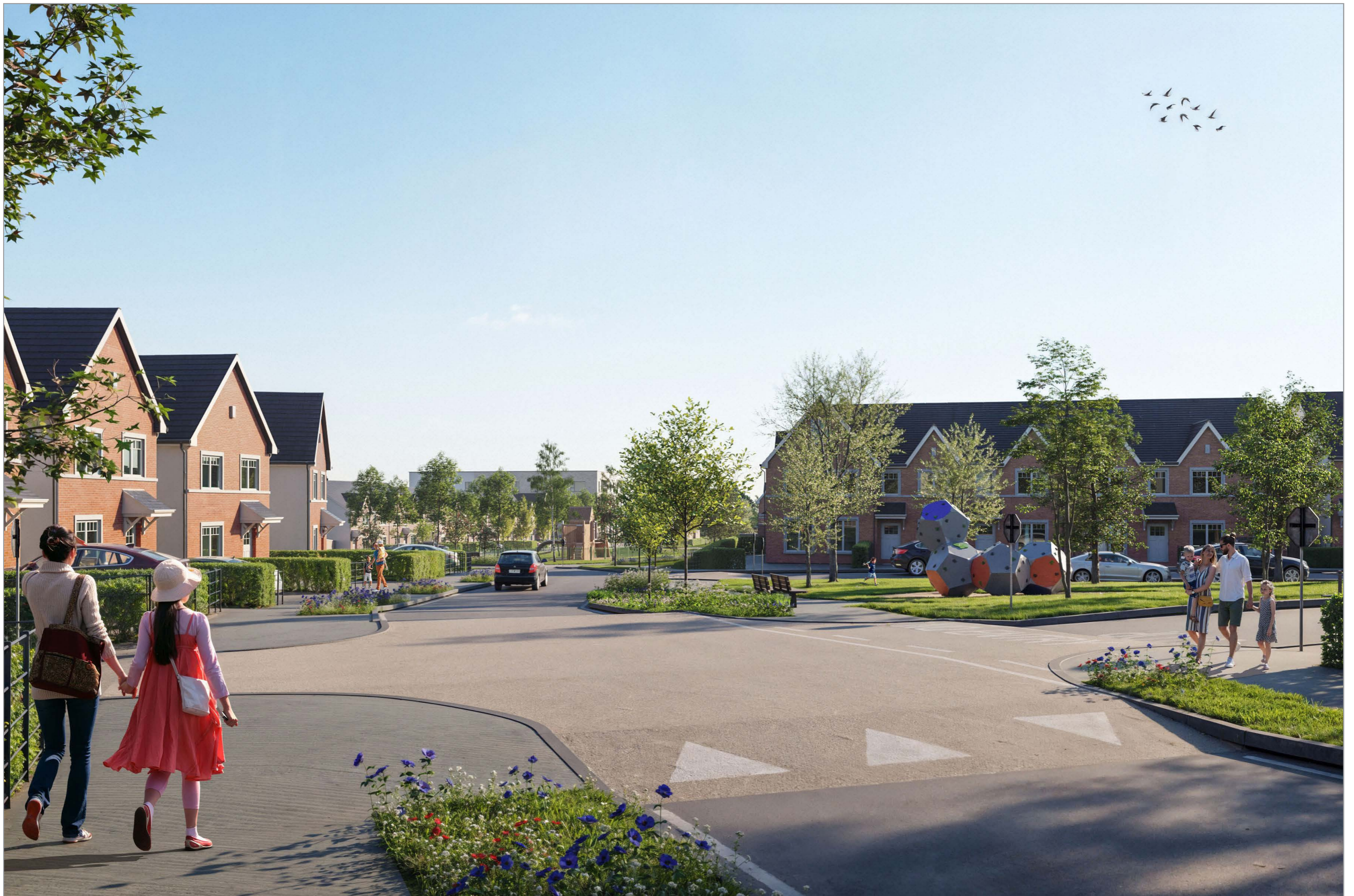
Location CGI 01