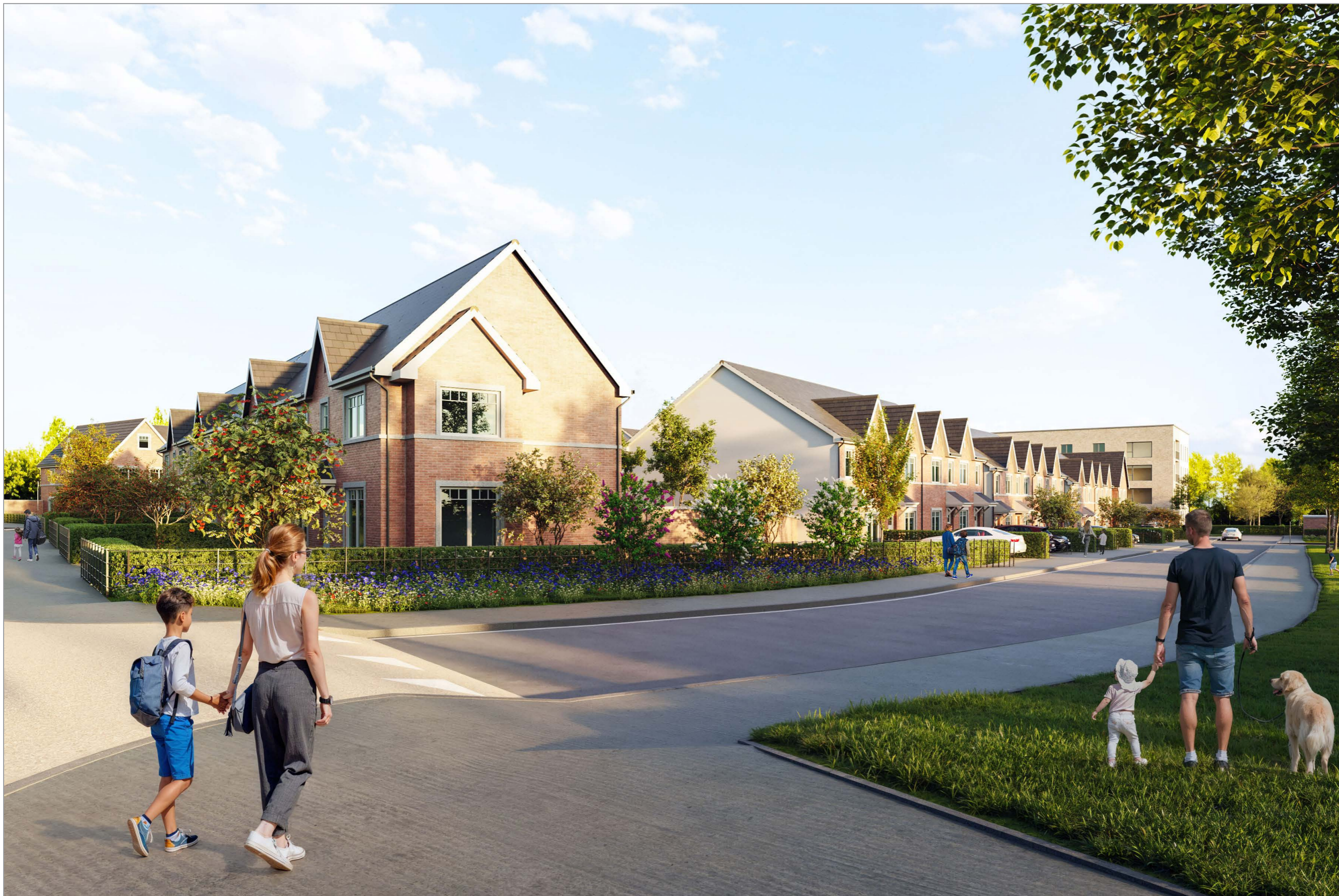
Location CGI 02