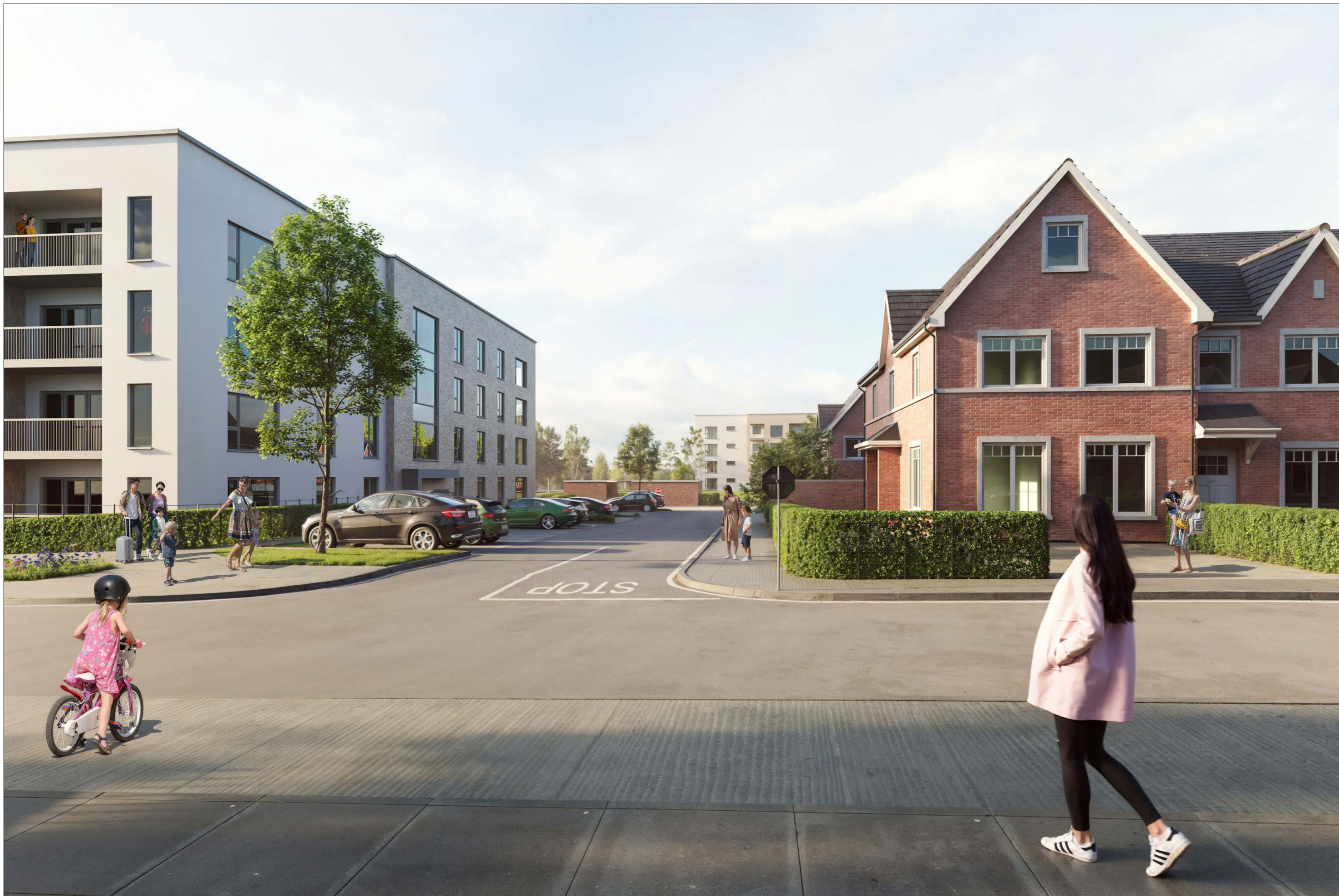
Location CGI 03